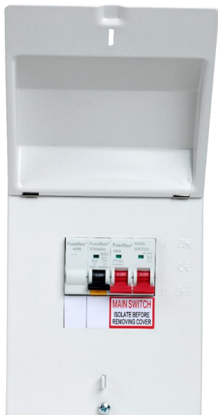
2 POLE MINI RCBO