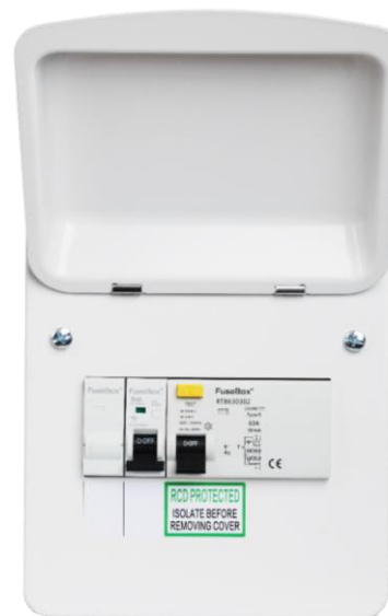
TYPE B RCD 40A B CURVE MCB