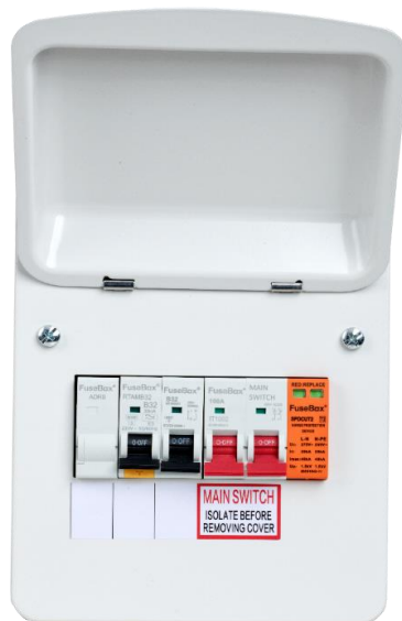
2 POLE MINI RCBO T2 SPD